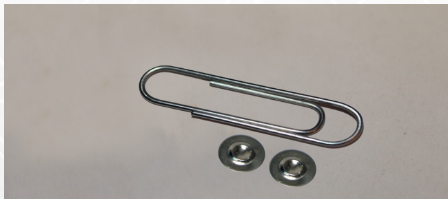
1/8 in (3mm) nominal size FRB disk adjacent to a standard sized paper clip.

BS&B focused R&D attention to miniaturizing the most advanced rupture disk designs that have long benefited the chemical process industry. Harnessing the use of shapes and structures to resist normal operating pressure and temperature conditions, the FRB, QRB and MRB rupture disks respond by opening with millisecond speed at the desired burst pressure providing the equipment designer with 'reverse buckling' disk superior performance.