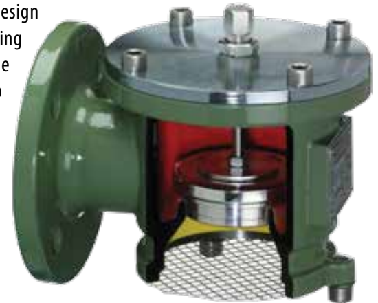
Model 943 End-of-Line Vacuum Relief Vent/Valve